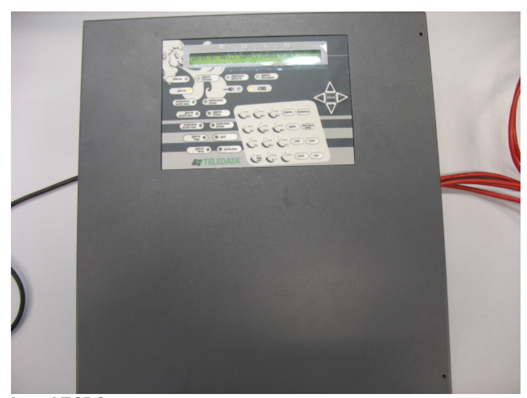
control panel EOLO